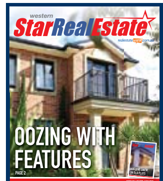
Property Lift out