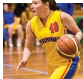
Devils in control