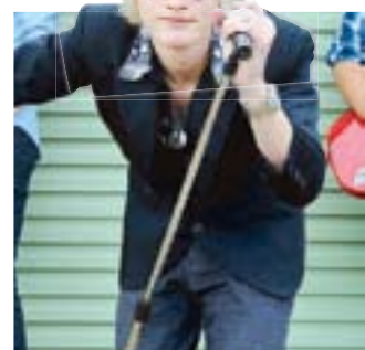
New rock Gods

For more information visit www.communityagainstcrime.com.au