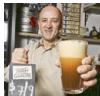
It's beer week!